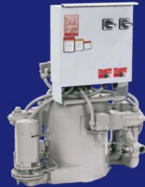
INDUSTRIAL VACUUM UNITS