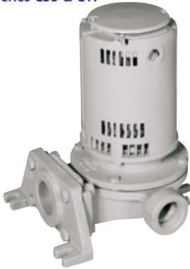
Series C35 & C17