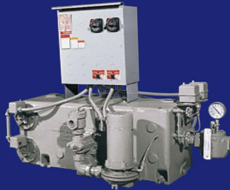
VACUUM HEATING UNITS