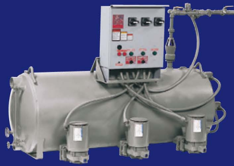
BOILER FEED UNITS