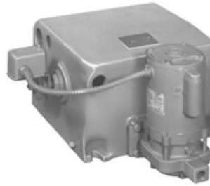
Condensate Transfer Units

Designs and manufactures an extensive line of heat exchangers for HVAC and industrial applications. Products include U-Tube, Straight Tube (with fixed or floating tube sheet), Brazen Plate and Gasketed Plate Heat Exchangers.