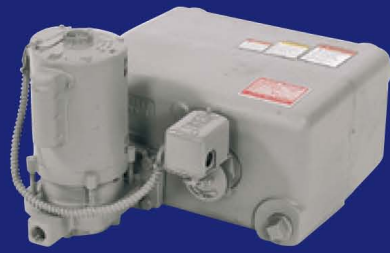
CONDENSATE RETURN UNITS