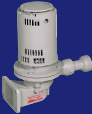
LOW NPSH PUMPS